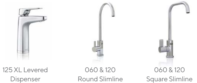
125 XL Levered Dispenser

Typical installation set-up - the image is for illustrative purposes only.