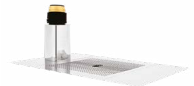
70mm riser and font*

* Optional matching riser and font accessories available for XL Levered Dispenser only.